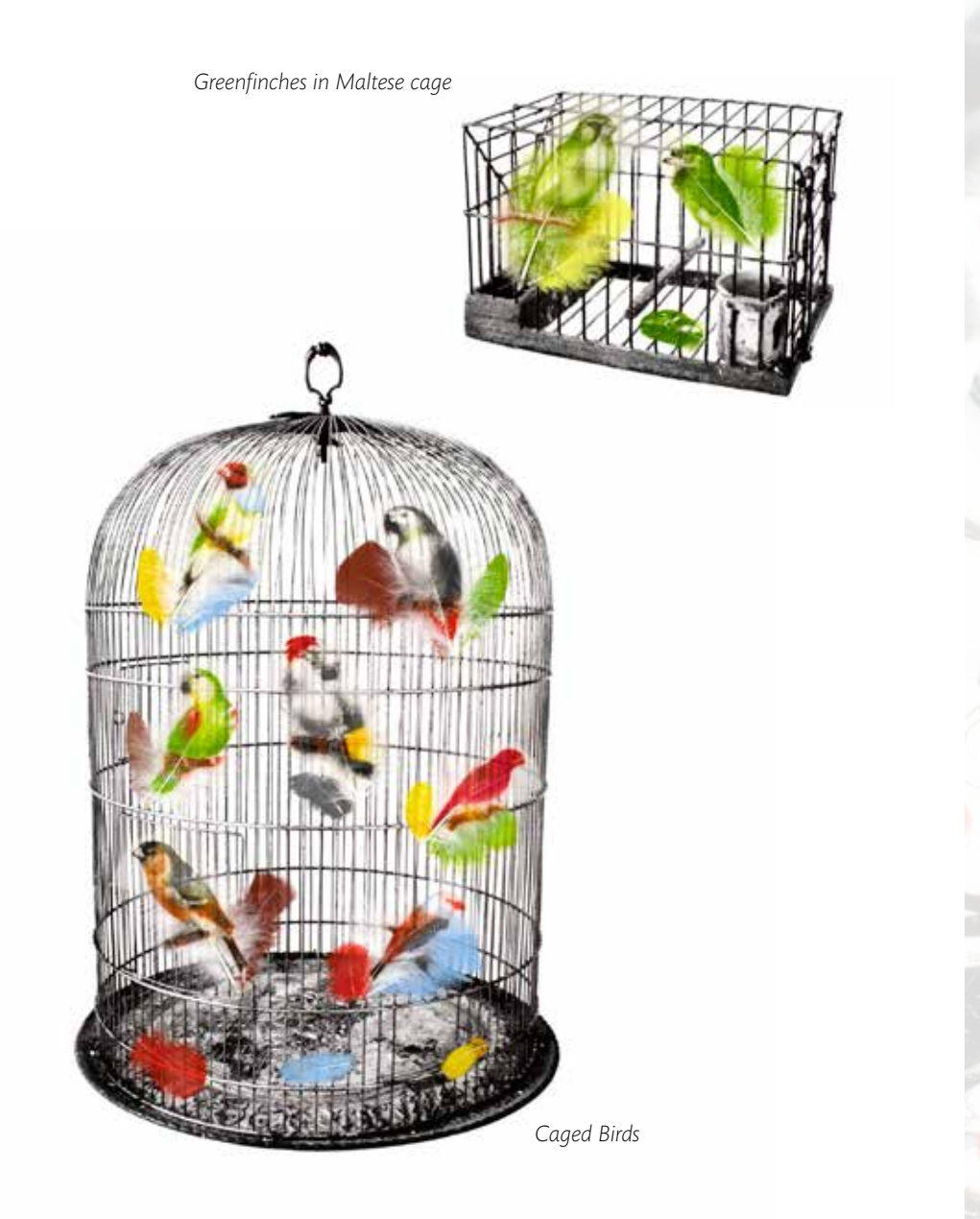
Greenfinches in Maltese cage