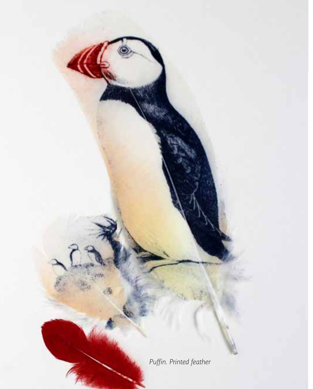
Puffin. Printed feather